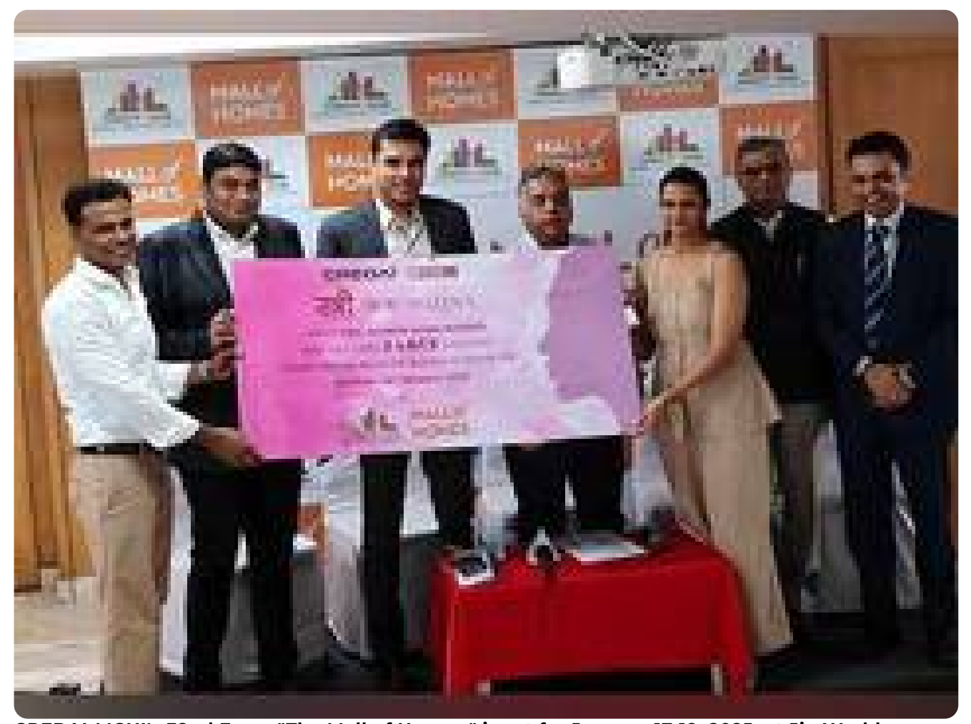
CREDAI-MCHI's 32nd Expo, "The Mall of Homes," is set for January 17-19, 2025, at Jio World Convention Centre, Mumbai

(/news/business/credai-mchis-32nd-expo-the-mall-of-homes-is-set-for-january-17-19-2025-at-jio-world-convention-centre-mumbai20250115134201)